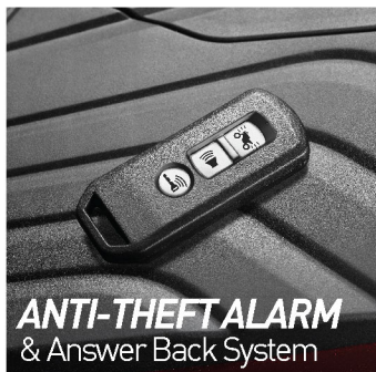
ANTI-THEFT ALARM & Answer Back System