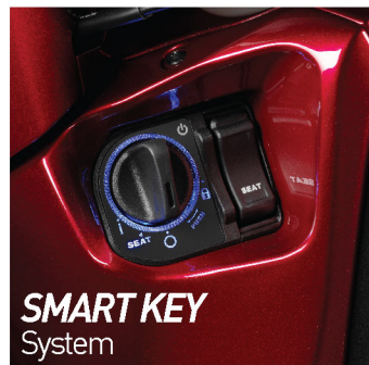
SMART KEY System