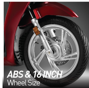
ABS & 16 INCH Wheel Size