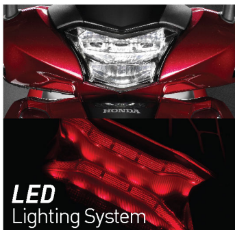
LED Lighting System