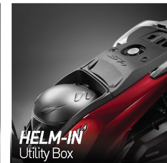
HELM-IN Utility Box