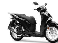
POSEIDON BLACK METALLIC

*Model shown are European type. Indonesian model may vary