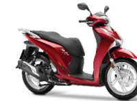
CANDY LUSTER RED

Front Brake Type Disc Brake | Rear Brake Type Disc Brake Braking System Antilock Braking System, 2-Channel Front Brake Spec 2-Piston Calipers, 240 mm Disc Rear Brake Spec 1-Piston Caliper, 240 mm Disc