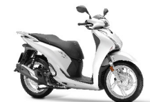
PEARL JASMINE WHITE